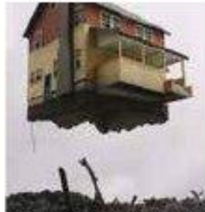
THOMAS DOYLE, '11-40 CHIFFSWA DE', MIXED MEDIA, 16 X 14 X 11 CM, 2011.