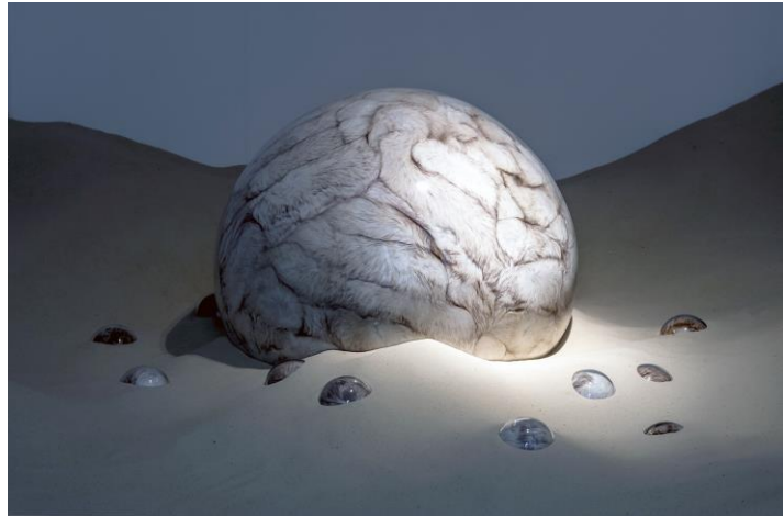
Left: Adeline de Monseignat, Home 9 , 2014, black marker on paper, 31 x 21.5 cm, Courtesy the artist and Ronchini Gallery Right: Adeline de Monseignat, Mother HEB Loleta , 2012, vintage fur, pillow filler, glass, motor, wood on 2 tonnes of sand, 380 x 180 x 244 cm, Courtesy the artist and Ronchini Gallery

Ronchini Gallery is pleased to present Home , an exhibition featuring new works by London-based Dutch-Monegasque artist Adeline de Monseignat. The exhibition, curated by Samia Calbayrac, explores the nostalgia of childhood memories through a large-scale installation that incorporates architecture, sculpture and drawing.