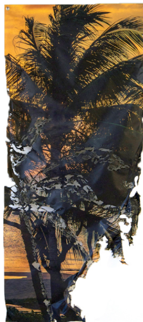
LEFT: Augustus Nazzaro, Banner , 2015, acrylic on panel, 14 x 11 inches