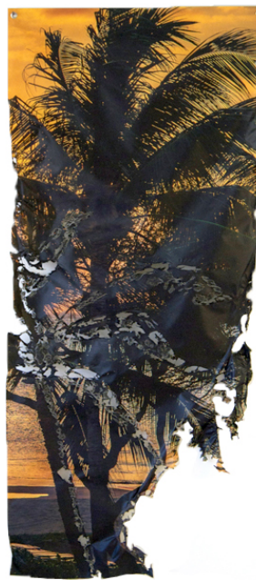
LEFT: Augustus Nazzaro, Banner , 2015, acrylic on panel, 14 x 11 inches